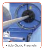
* Auto-Chuck, Pneumatic