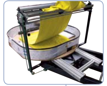
Pull-out Table for Prefeed Device (option)

EC300-S equipped with E-Drive/High Prefeed Device and Pull-out Table for easier loading.